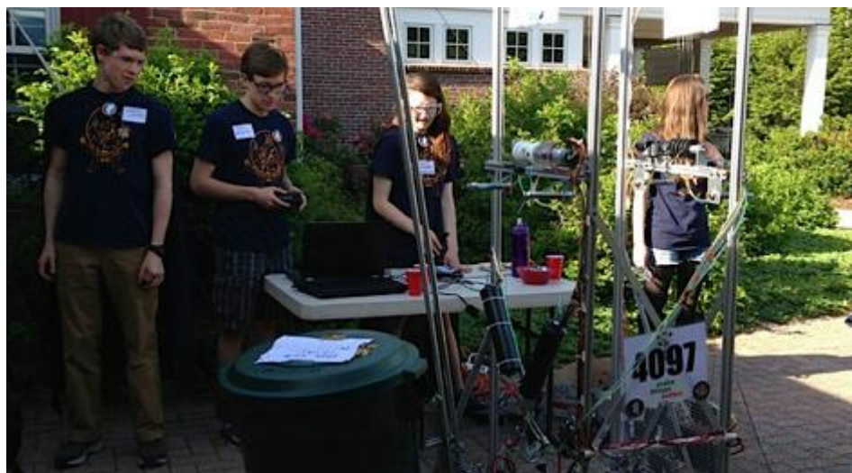
The award-winning NHS Robotics team, launched with an NEF Endowment grant