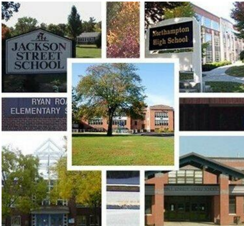
NEF Endowment grants enrich all Northampton public schools