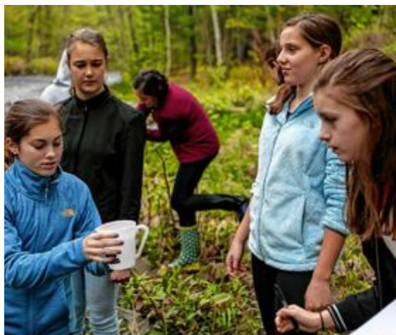
Students testing water for a Global STEM project, funded by the NEF Endowment