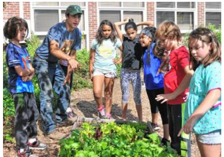
Students in their "Outdoor Classroom," funded at all four elementary schools for five years by the NEF Endowment