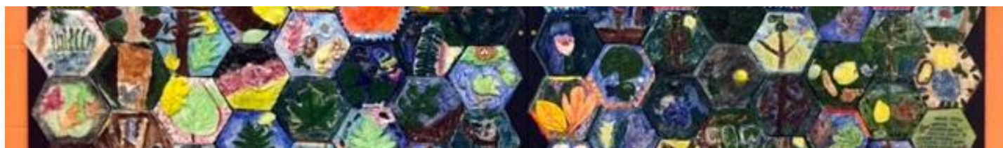
"Childs Park: 'Sharing Place' - A Multi-School Tile Installation," a NEF Endowment-funded collaboration between Northampton High School, Bridge St. School and Jackson St. School.

This list includes all known donors to the NEF Endowment from 2002 through March 5, 2020. Donors who contributed to both the founding Endowment campaign and the most recent campaign, which concluded on 12/31/19, are indicated with *