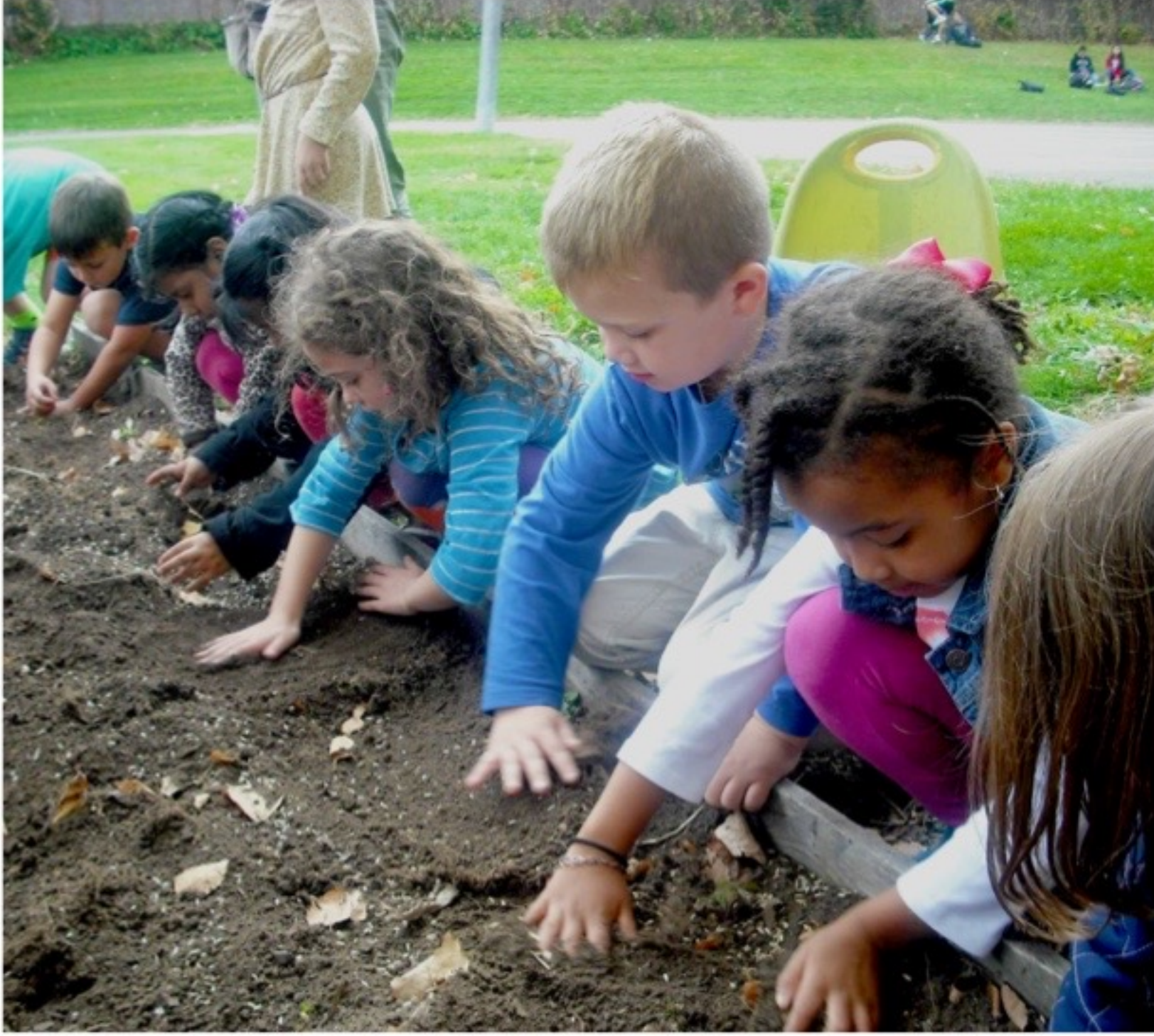
▲ Elementary school students plant the seeds of their later gifts to local officials.