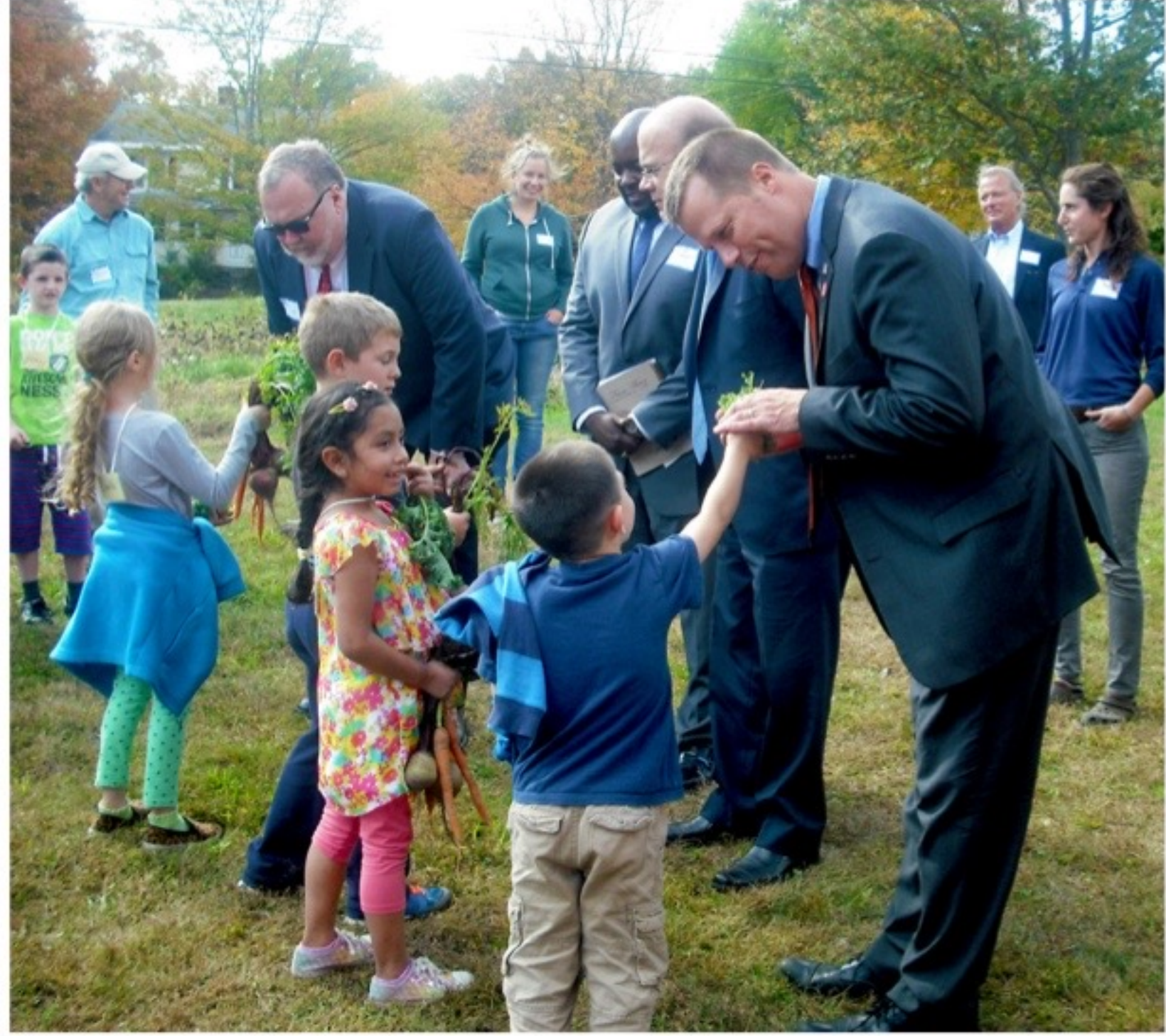
▲ Jackson Street School student offer their garden wares to local officials.