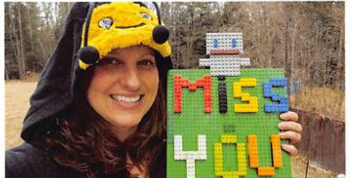
We all look forward to a safe return to a normal school year!