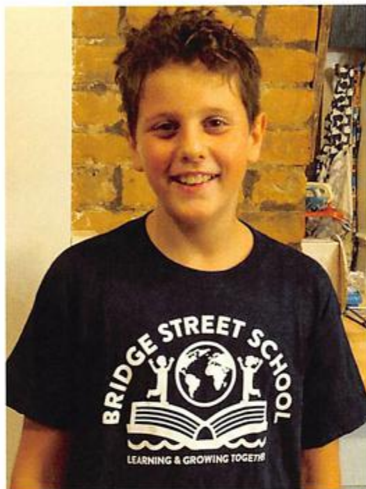
Bridge St School students worked with a graphic designer and staff to collaborate on the creation of a school logo through a Small Grant.