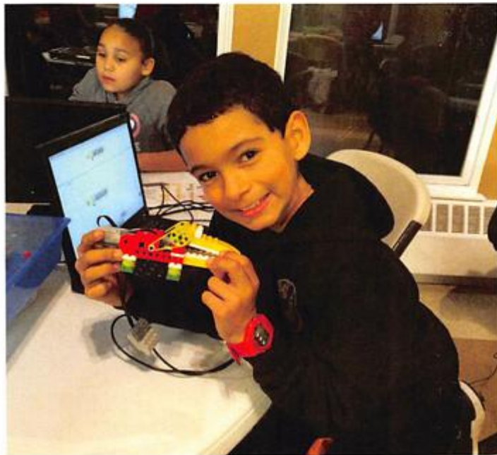
Building Lego robots in the Community Outreach Program.

A Community Investment in Our Public Schools