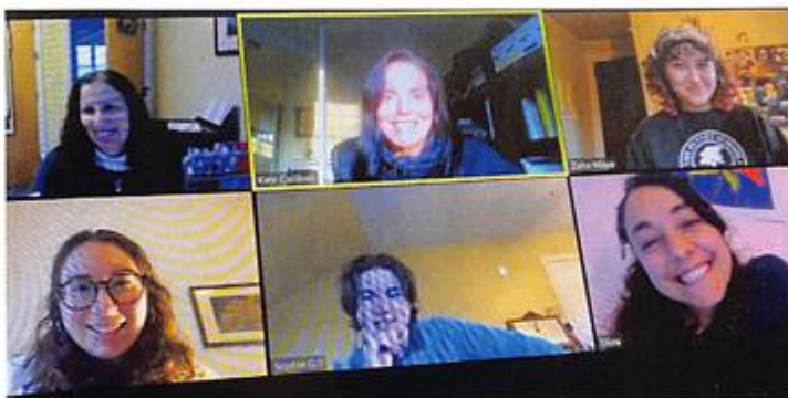
Community members, staff and NHS alumni prepare for their zoom improv class