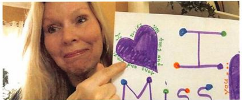
Teachers with love and commitment sent out beautiful videos to students after school closures in the spring.