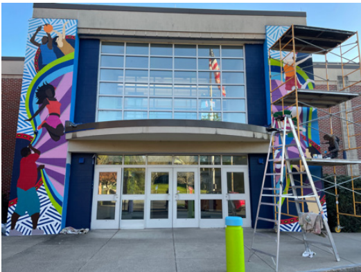
Mural project at NHS, with support from a 2021 NEF Small Grant to Teachers

Thanks to the generosity of our donors and those who shopped at our spring garden market, NEF is pleased to announce that we raised $17,000, which will be allocated to Northampton schools this fall for the purchase of classroom texts, library texts, instructional materials, or digital learning resources. Last year, each school used some of the funds to expand their library resources. In addition, Northampton High purchased books and musical compositions for Fine Arts, added additional texts to accommodate greater enrollment numbers in certain classes, and added texts to ninth grade to assist students having trouble reading Shakespeare. The sixth grade at JFK Middle School purchased young adult fiction and memoir to pilot a reading workshop approach. The elementary schools continued to diversify their curriculum and expand their resources for their youngest learners.