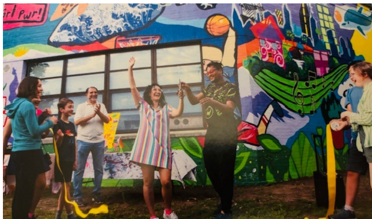
Mural at JFK Middle School, projected funded by NEF

Preschool students and teachers will receive custom-designed lessons and activities to advance students' spatial awareness, encourage individual expression, and provide mindful practices for self-regulation all through music and movement.